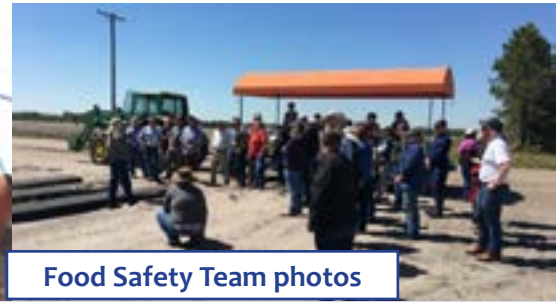
Food Safety Team photos