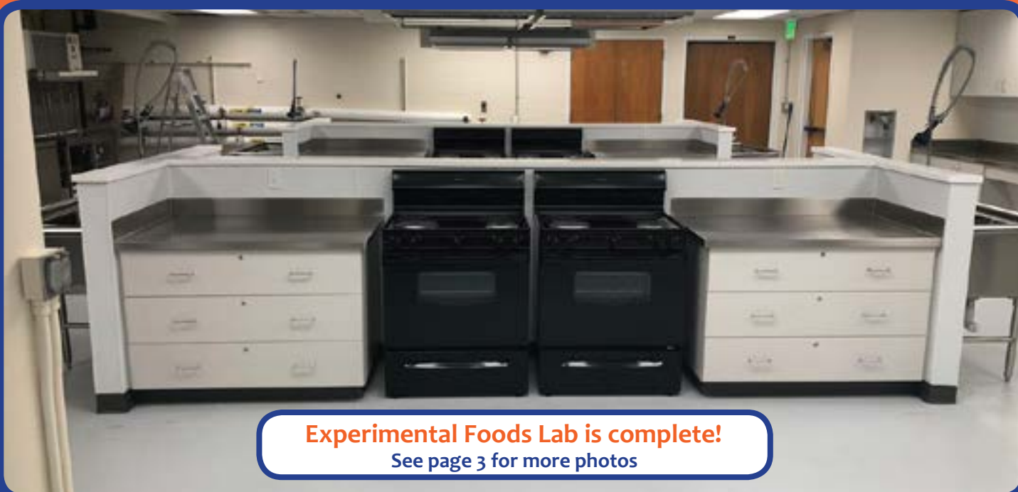
Experimental Foods Lab is complete! See page 3 for more photos

Inside This Issue... Alumni & Friends (p. 2); Department Activities (p. 3) Retirements & New Faculty (p. 4-5), Faculty News (p. 6-7), Job Announcement & Contact Info (p. 7)