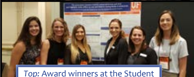
Top: Award winners at the Student Recognition Night hosted by FL Section IFT and FSHN. Bottom: 1st Year MS-DI students present their research at FL FANS.