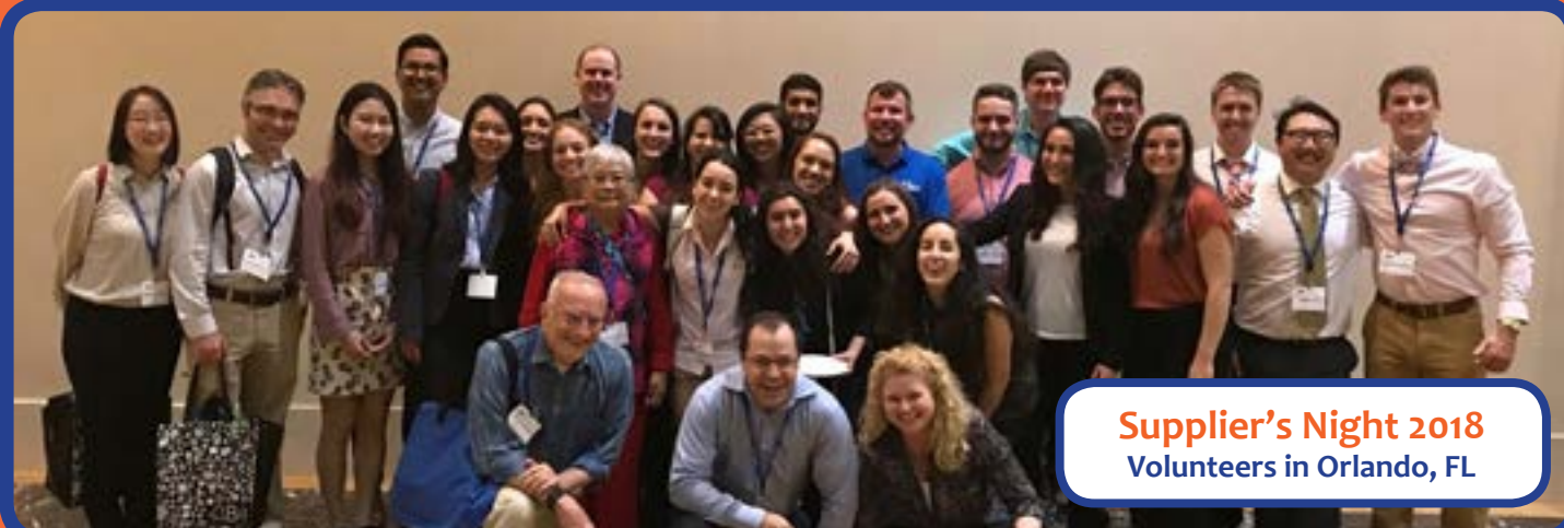
Supplier's Night 2018 Volunteers in Orlando, FL

For Alumni, Students, Associates and Friends of FSHN IFAS, College of Agricultural & Life Sciences, University of Florida