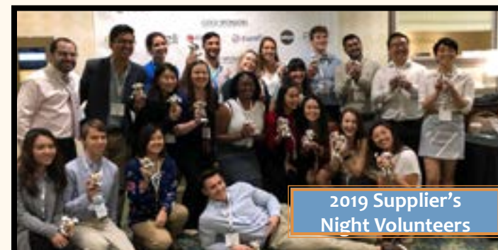
2019 Supplier's Night Volunteers