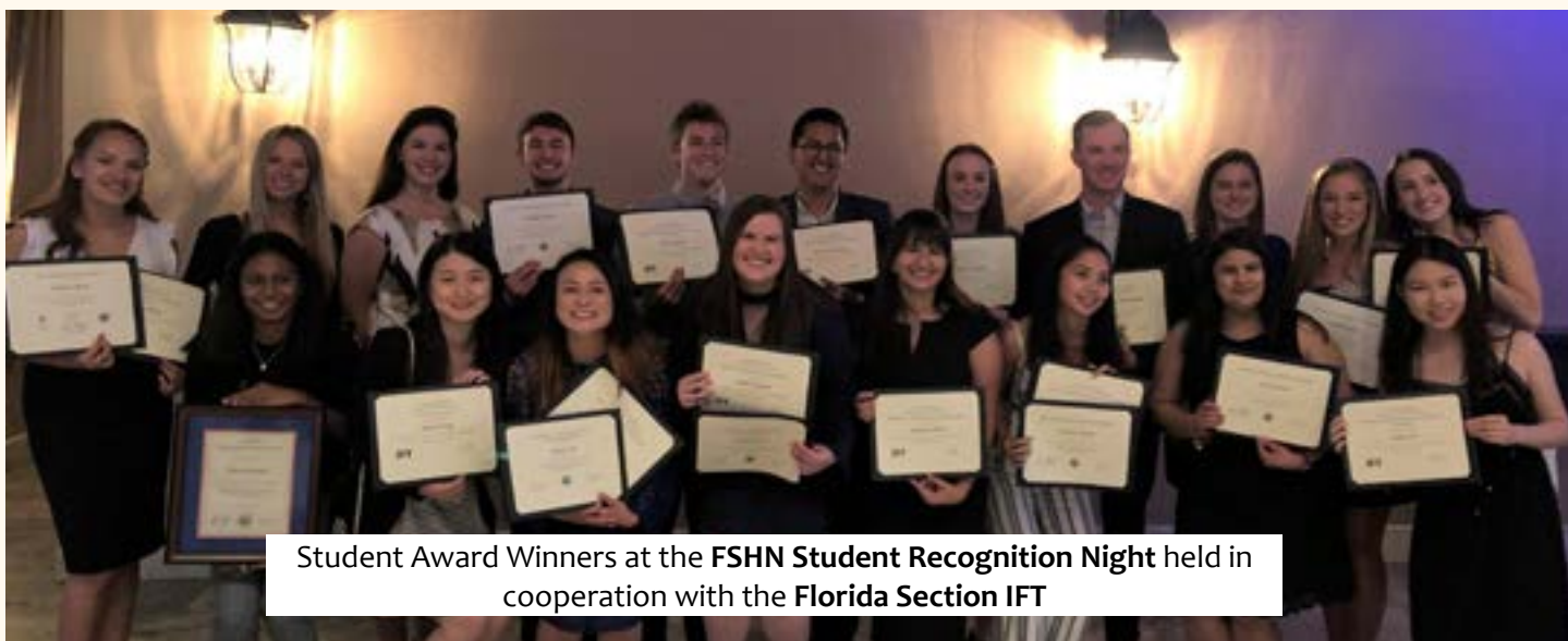
Student Award Winners at the FSHN Student Recognition Night held in cooperation with the Florida Section IFT

For Alumni, Students, Associates and Friends of FSHN IFAS, College of Agricultural & Life Sciences, University of Florida