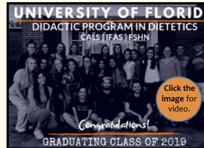
Click the image for video.