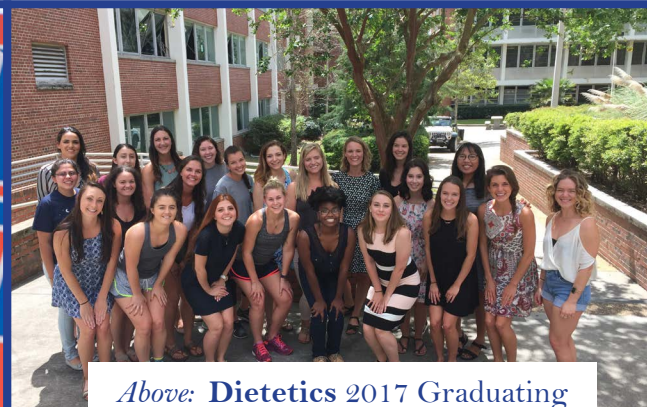
Above: Dietetics 2017 Graduating Class; Below: Food Science College Bowl Team in Clemson, SC