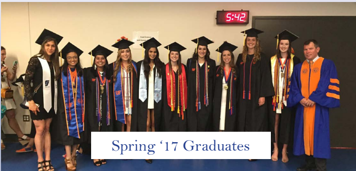
Spring '17 Graduates