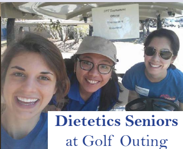
Dietetics Seniors at Golf Outing