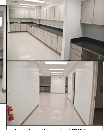
Above: the newly completed FSHN clinical research lab.