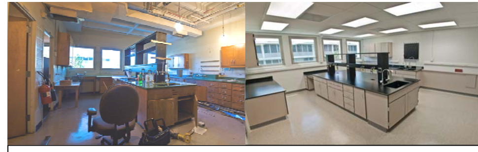
L-R: Before and after pictures for the newly renovated lab in Room 341, FSHN Building.

....lab are shown on the right. Other new projects include the relocation of Undergraduate Student Services to offices in the Pilot Plant in order to make the advisors more accessible to students and provide increased building security. Also, the teaching labs on the third floor are being re-designed to provide improvements in both efficiency and safety. Since that space will be devoted solely to teaching with no administrative offices, the finished product will be a much larger laboratory space in which to teach both graduate