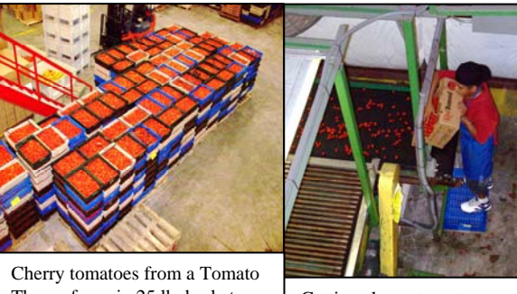
Thyme farm, in 25 lb. baskets.

Tomato Thyme's philosophy is simple, 'We Put Food Safety First.' Food safety is the most important of all our operations, and it is discussed at each and every meeting. Every management action ensures that food safety not only fits into the overall objective of Tomato Thyme Corporation, but also that every employee is educated about it and fully understands it.