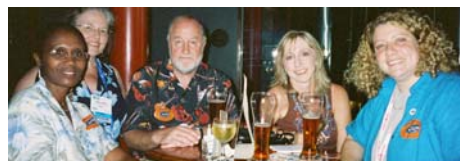
From the 2005 IFT Florida Social Hour.

meeting in New Orleans, FSHN organized the first-ever Florida Social Hour with the help of Florida Section IFT. Designed not only for UF alumni but also to bring together food science students and professionals from around the state of Florida, the Social Hour, held at the Crescent City Brewhouse in the French Quarter, was a great success. Look for this event at all future national IFT meetings, and help us create stronger ties between alumni, current students and faculty, and industry in Florida.